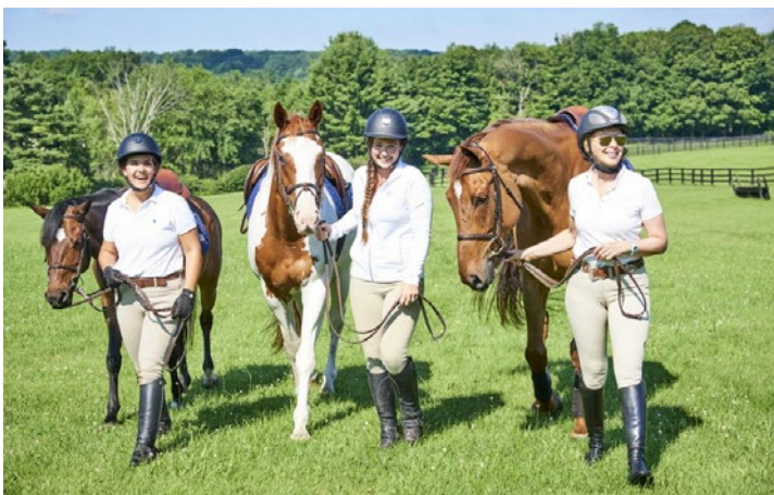
Silo Ridge Field Club's Outdoor Pursuits program offers members guided excursions, including horseback riding.

Oak floors, reclaimed wood, locally-sourced stone, folk art, and Americana relics lend authenticity to The Barn's flexible spaces and the cultural landscape. Even The Barn's exterior boasts reclaimed wood from a local barn.