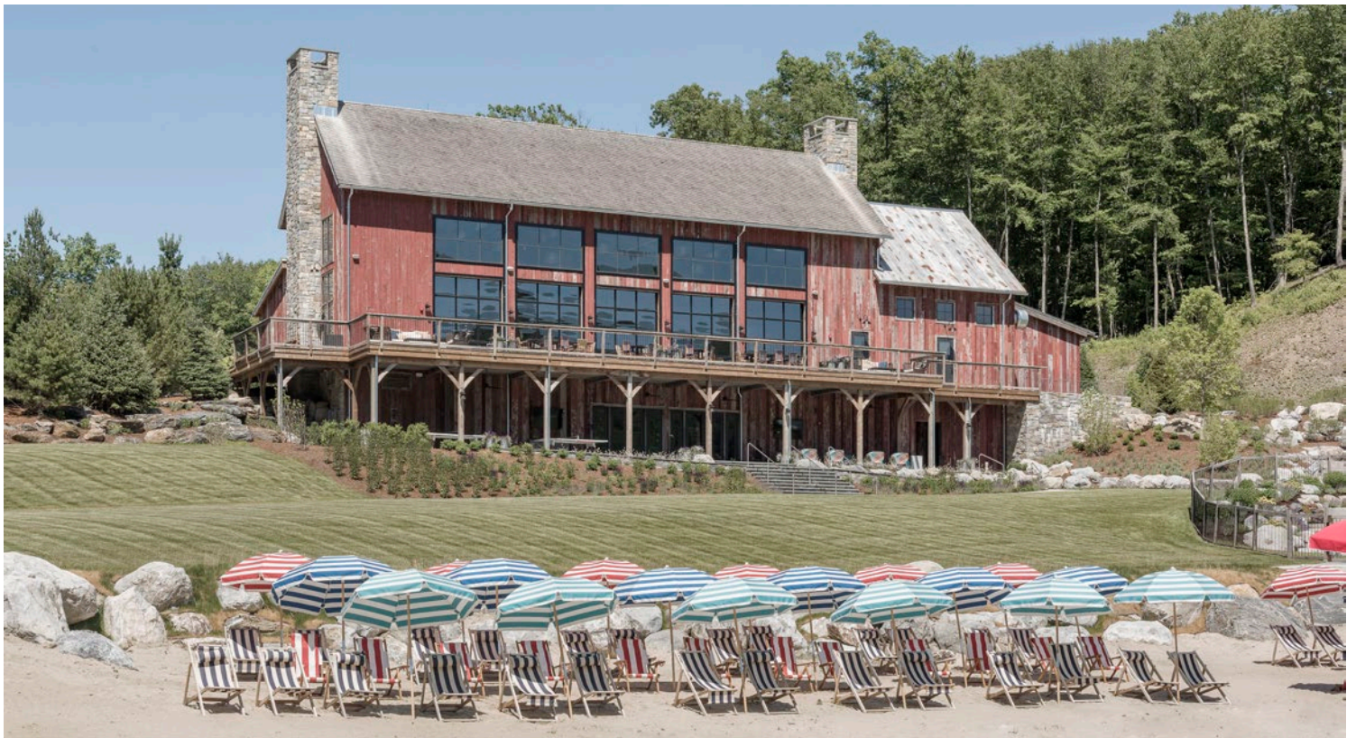
The Barn's design utilized traditional construction, weaving, and milk paint finishing techniques.

Now, as New York state successfully lowers COVID-19 cases, a new phase of reopening coincides with the debut of The Barn , Silo Ridge's brand new 11,000-square-foot multipurpose family entertainment, activity and casual dining space.