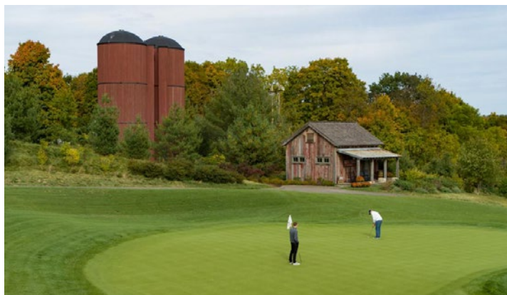
Rusty silos and comfort stations are among charming outposts along Silo Ridge’s golf course.

Primarily a second residence community, Silo Ridge has been an ideal quarantine escape. More than 100 owners have ridden out the coronavirus epidemic in the socially-distanced enclave—playing virtual bingo, bakeoffs, and Zoom workouts. Thirty-five percent sold, there’s still time to escape the city for this quaint getaway.