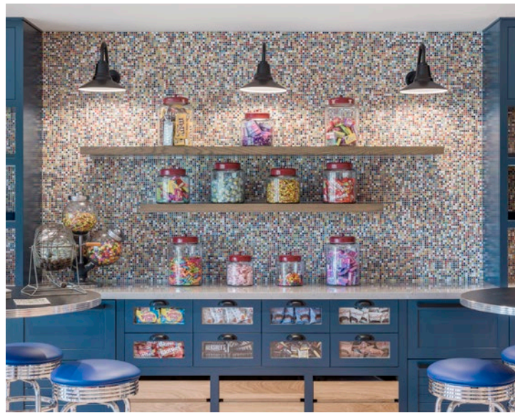
Whimsical candy station

Collaboratively designed by Alder & Tweed, WC Ralston Architects and others, the sustainable facility is inspired by Hudson Valley architecture and executed by local artisans who infused Shaker-style furnishings and vintage accessories into the design.