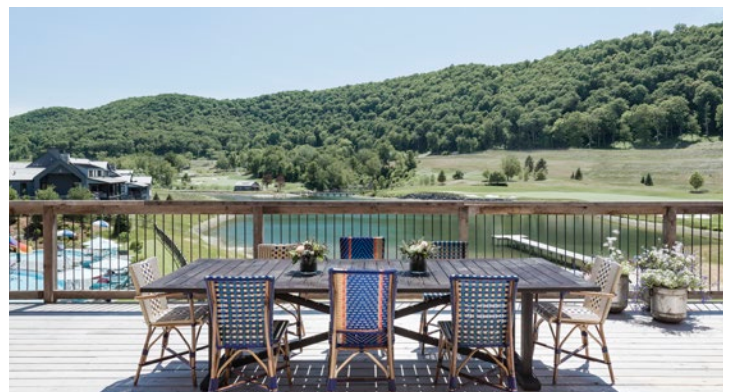
Sweeping view of lake, pool and landscape from The Barn's expansive upper deck.