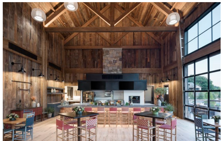
The Barn offers a 120-seat dining room, bar, double-height fireplace, and long farmhouse-style tables for gatherings.

Here, resident members can enjoy concerts, movies, televised sports, arts-and-crafts, and local terrain-to-table fare at private or communal tables. The Barn includes a relaxed 120-seat dining room, bar, double-height fireplace, and long farmhouse-style tables for family and friend gatherings.