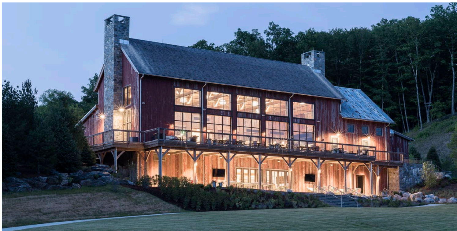
The Barn is Silo Ridge Field Club's new 11,000-square-foot multipurpose family entertainment, activity and casual dining space.