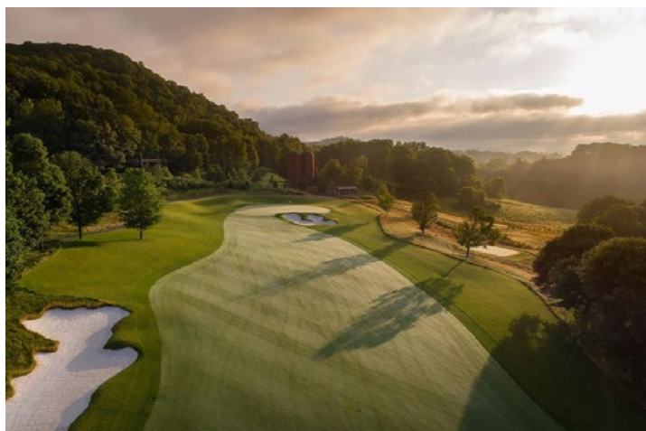
Silo Ridge Field Club's member's-only 18-hole golf course was designed by renowned golf architect Tom Fazio