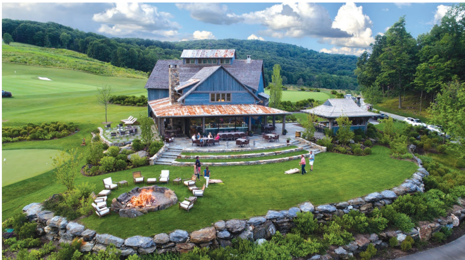
Ridge House amid a verdant landscape. More than 100 members rode out the coronavirus shutdown at Silo Ridge Field Club, an 850-acre gated community.