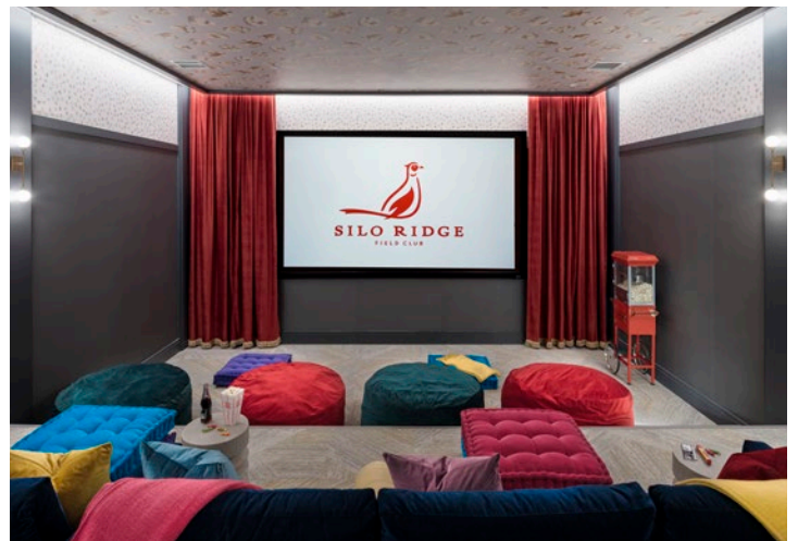
The Barn movie theater