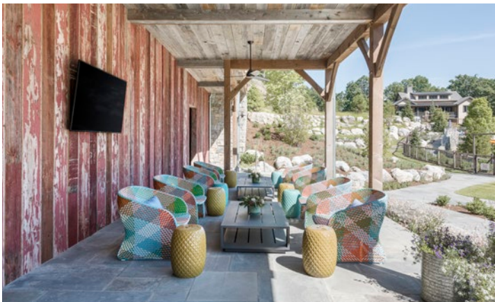
The Barn's kid-friendly lower level is decorated with reclaimed wood and whimsical colors.