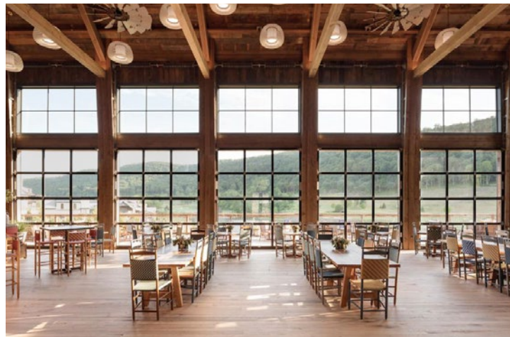
The Barn offers a 120-seat dining room, bar, double-height fireplace, and long farmhouse-style tables for gatherings