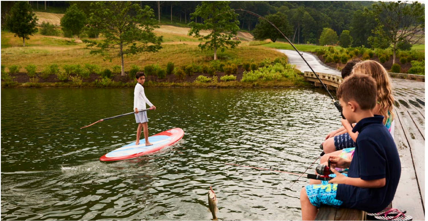
Silo Ridge Field Club's lake offers paddleboarding, kayaking, canoeing and fishing.