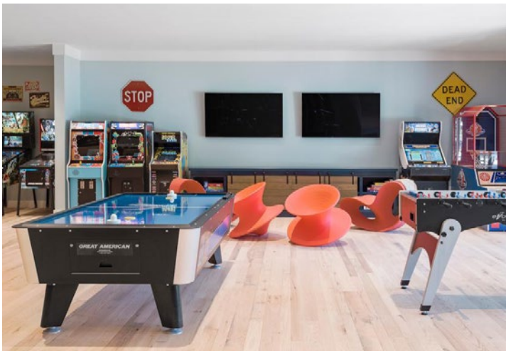
Kids game room on The Barn's lower level